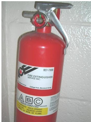
This is an example of a Class ABC multi-purpose rated fire extinguisher.