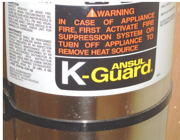
This is an example of a Class K fire extinguisher. Note the warning to only use after suppression system has been activated.

Many people are unaware that the majority of portable extinguishers are best suited for fighting very small or confined fires (in wastebasket for example). Some completely discharge in as few as eight seconds. This does not necessarily mean “the bigger the better” philosophy should be used, as larger extinguishers can be heavy and difficult to operate. For most buildings, an ABC-rated extinguisher is sufficient, but if you have a commercial kitchen consider installing a K-rated extinguisher there.